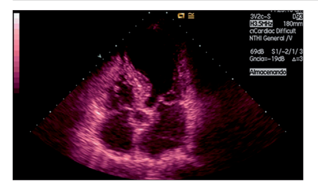
Figure 1. Echocardiographic image in apical ballooning which is also observed mitral prolapse (P2).

above normal, it is very marked [46] for several weeks and falls progressively. Elevation of C-reactive protein (CRP) is detected in 50% of patients and is a sign of poor prognosis and predictor of mortality [36,64,112] in TS.