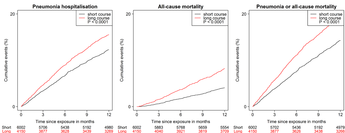
Figure 2 Cumulative incidence curves for the three outcomes among COPD outpatients treated with long vs short course of OCS, 2010–2017 ( P<0.0001 ).

As part of the sensitivity analyses, all pneumonia and death events were removed up to day 30 and all analyses for the primary endpoint were repeated, which showed consistent results (table 2). With this sensitivity analysis, we wanted to exclude the possibility that it was not the increased risk the first month that was responsible for the continued risk of pneumonia or all-cause mortality 1 year after, that is, remove an ‘acute illness factor’ as a possible driver of events. In a second sensitivity analysis, censoring patients prior to the second OCS prescription showed consistent results for pneumonia hospitalisation, from OCS exposure to 1-year follow-up (aHR 1.1, 95% CI 1.0 to 1.3; p=0.1102 ), using the short course as a reference (table 4).