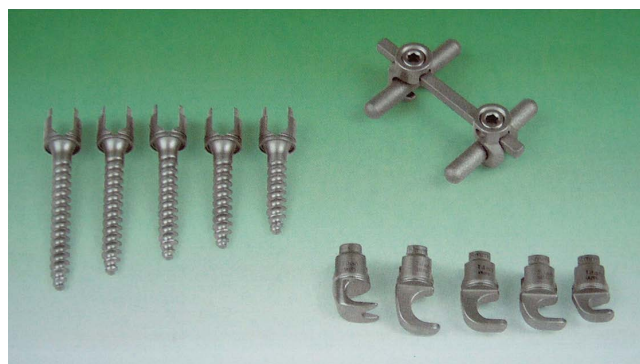
Figure 1 Instrumentation system WSI Titan, an over the top loading system with screws and hooks.

The implant is a double rod system made of pure titanium rods with a diameter of 6 or 7 mm, respectively, which allows segmental fixation through lamina hooks and/or conical pedicle screws fabricated from TiAl6V4 alloy. It is a "over the top" loading system (Figure 1). The indication for operation was progression of the AIS with a main curve of over 45° in the frontal plane. Anterior release to mobilize a rigid main curve was not an exclusion criterion. No additional procedures such as rib osteotomy were performed in any of the patients. For preparation and mobilization for the operation, all patients carried out Cotrel self-extension over a period of 2 to 3 weeks. All patients received a perioperative antibiotic prophylaxis with intravenous cephalosporin. All operative procedures were performed by the senior author (H.G.). The operative procedure involved mobilization of the scoliosis by resection of the spinous processes, decortication of the laminae, facet joint cleaning and division of the ligamentum flavum on the concave side of the curvature. The scoliosis was then corrected by inserting the hooks and