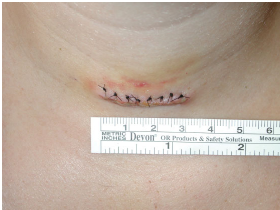
Fig. 1 Length of incision in centimeters.

As this study was performed in three different institutions (Hospital of Saint Raphael, Midstate Hospital, and Middlesex Hospital, Connecticut), there were some minor variations in gross histologic assessment. In the majority of cases, the entire thyroid gland or hemithyroidectomy and isthmus