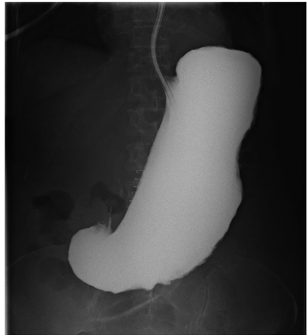
Figure 2: Upper gastrointestinal series 2 h after gastrografin contrast administration down nasogastric tube demonstrates no leak and no passage of contrast from severe gastroparesis.