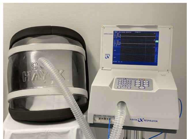
FIGURE 3 Hayek RTX Biphasic Cuirass Ventilator. The ventilator is connected to the cuirass shell with a tubing. The flexible cuirass shell is available in different sizes ranging from small neonatal size to large adult size [Colour figure can be viewed at wileyonlinelibrary.com ]

The biphasic cuirass ventilation (BCV, Figure 3) device can be used in different modes: It can be used in a continuous negative pressure or a biphasic mode, suitable for controlled or triggered ventilation (even with cardiac synchronization), or can deliver a