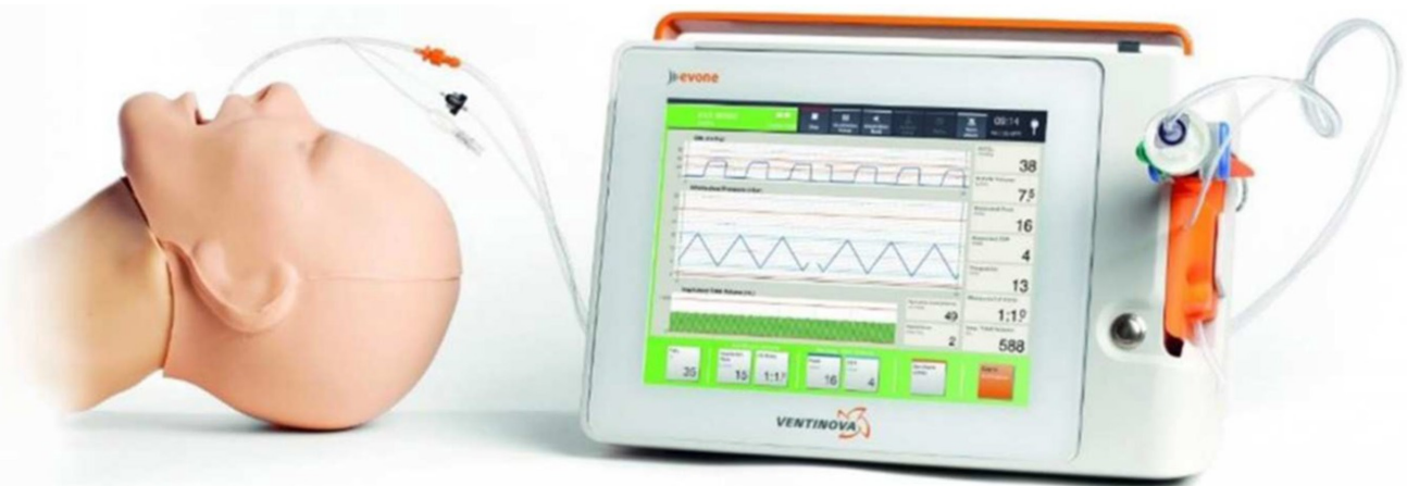
FIGURE 2 Evone ventilator (Ventinova Medical B.V., Eindhoven, the Netherlands) connected to a mannequin with the Tritube for flow-controlled ventilation. Reproduced with permission from 48 [Colour figure can be viewed at wileyonlinelibrary.com ]

Despite the aforementioned advantages of FCV, including the lung-protective ventilation, it also has some limitations. In its current setting, Evone ® FCV can only be used with total intravenous anesthesia since vaporizers cannot be included in the breathing circuit. This aspect is highly relevant in pediatric anesthesia. The system lacks adaptive ventilation modes and the possibility to be triggered by the patient; hence, patient-ventilator synchrony or weaning can be problematic. Although there is some exciting evidence for better gas exchange and protective ventilation, there is a lack of hard evidence for its use in different situations (eg, pediatric anesthesia) or pathological conditions (eg, asthma). At present, the Evone ® FCV is only recommended by the manufacturer for use with an ideal body weight of over 40 kg. Further research is required to clarify whether there are advantages from FCV for the pediatric population. Furthermore, the Evone ® ventilator might also require technical adjustments to operate with the low tidal volumes necessary to ensure safe ventilation for children.