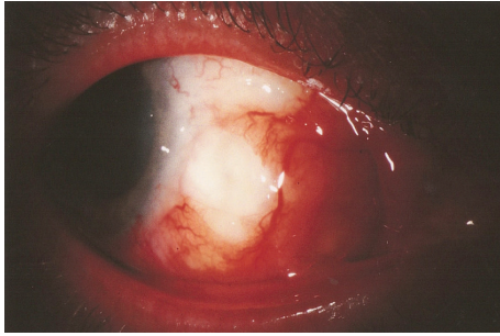
FIGURE 1: Slit lamp photograph showing area of redness and abscess formation on the temporal aspect of the globe.