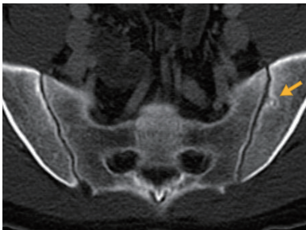
Figure 2. Axial view of abdominopelvic computed tomography scan showed an erosion on the left iliac side of the sacroiliac joint (yellow arrow).

Fig. 2 displays a representative image of erosion among CD patients. According to the CT scoring tool, sacroiliitis was found in 13.3% of the CD patients and 4.8%