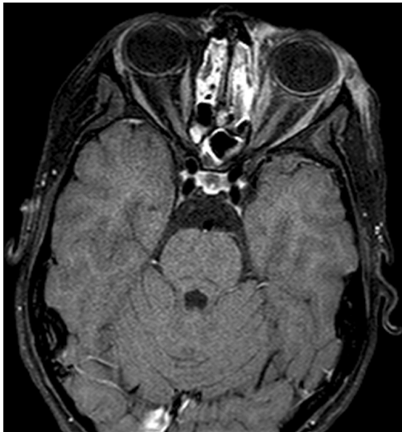
Figure 2 Axial contrast-enhanced fat suppressed T1-weighted MR. The image demonstrates ethmoid and sphenoid sinusitis and an heterogeneous enhancement of left eyelid tissues and of orbital fat. The left orbital extraocular muscles show a moderate enhancement due to edema and hyperaemia. Left medial rectus muscle is also moderately thickened.

Orbital complication accounts for 74 - 85% of complications arising from acute sinusitis and usually this is secondary to acute ethmoidal sinusitis since the ethmoid sinus is separate from the orbit only by the papyracea lamina [7]. In a paediatric series, Nageswaran et al. found that 98% and 71% of their patients with orbital cellulitis were affected by ethmoid or maxillary sinusitis respectively [5]. Furthermore bilateral pansinusitis is the most common presentation [6]. As in this case, an abscess may be present in the subperiosteum of the lateral wall of the lamina papyracea [8]. It was estimated that the incidence of a subperiosteal abscess in orbital infections is about 15% in children [6]. The etiology of orbital cellulitis is usually unknown because blood cultures are often negative. Sinus cultures reveal typical acute sinusitis pathogens including Streptococcus pneumoniae , Haemophilus influenzae , Moraxella catharralis , Streptococcus pyogenes , Staphylococcus aureus , \alpha - and nonhemolytic streptococci and anaerobic bacteria of the upper respiratory tract [5]. Subperiosteal abscess cultures showed S. pneumoniae , group A streptococci, H. influenzae , as the major pathogens in a previous paediatric series [9]. Polymicrobial infections are also common