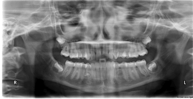
Figure 3 Orthopantomography. Image shows a bilateral opacity of the maxillary sinuses.

and may be more frequent in older versus younger children [10].