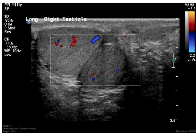
Fig. 1. Scrotal USS showing ipsilateral and supernumerary right testes.