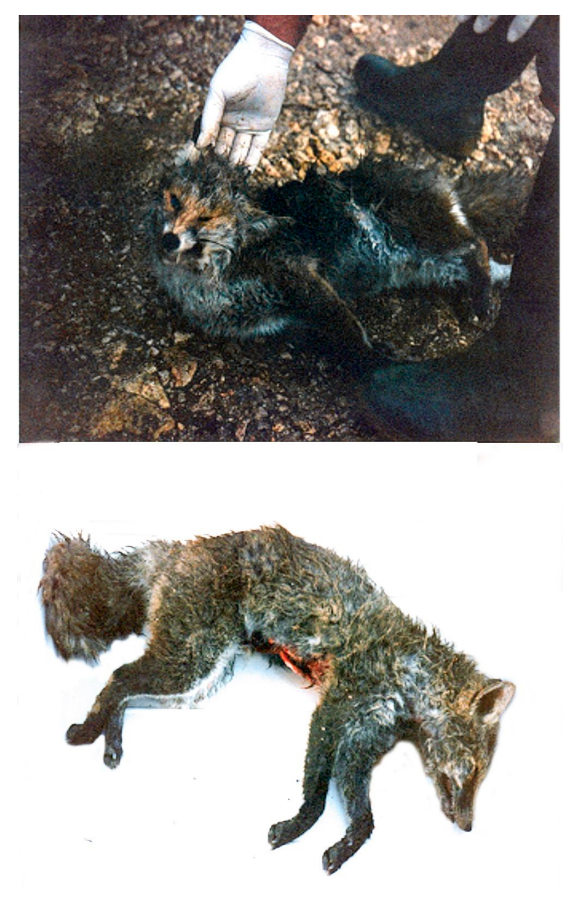
Figure 1. A fox affected by Aujeszky's disease, found dead near the farm where the outbreak was located.