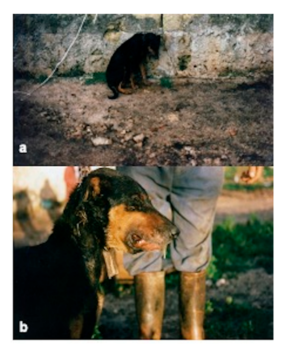
Figure 3. Dog with symptoms of Aujeszky's disease. ( a ) severe prostration in the interval between one itch attack and another; ( b ) evident sialorrhea in the final stages.