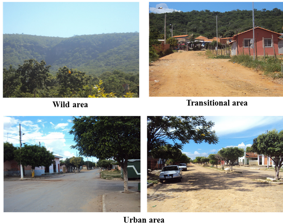
Fig. 2 Localities where phlebotomines were collected in 2013 and 2014 in the district of Barra do Guaicui, Minas Gerais, Brazil