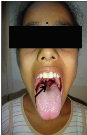
Figure 1: Thyroid tissue seen at the posterior aspect of tongue

During puberty, lingual thyroid can increase in size and cause obstructive symptoms.