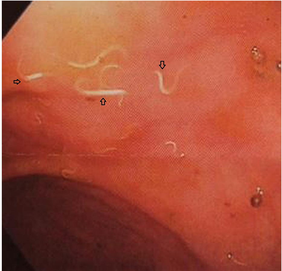
FIGURE 2: Colonoscopy showing helminths (arrowheads) in the sigmoid colon