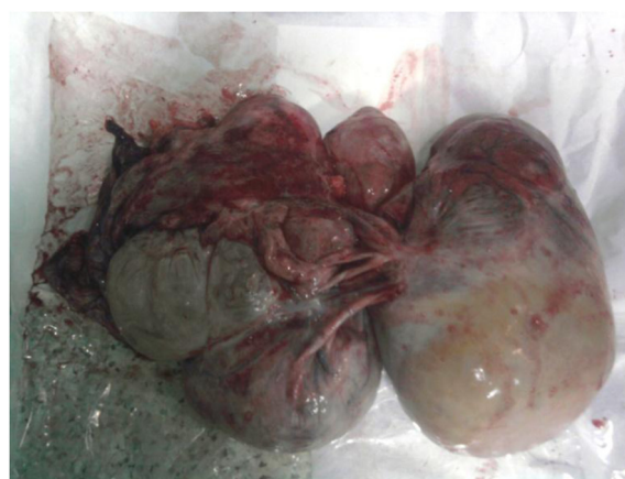
Figure 2 Abdominal tumor encapsulated after resection surgery.