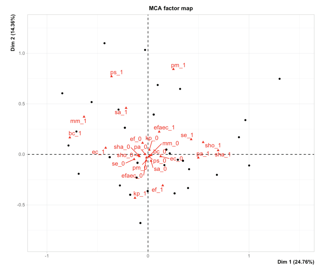
Figure 1. MCA Plot for describing the association among species of bacteria. The positions of the categories (0 for absence or 1 for presence) are indicated by triangles; the labels used for species of bacteria are reported in table 3 (column: Code). Patients are indicated by black points. The arrows represent the original position in the graph of the species of bacteria which are near to the origin.

first axis diversified subjects who had the Escherichia coli and not the other three species from subjects who had not the Escherichia coli and had the other three species. In fact, 17 patients, out of 18 infected by Staphylococ cus epidermidis , were not infected by Escherichia coli , 10 patients, out of 10 with Staphylococcus hominis , did not present Escherichia coli , and 8 patients, out of 9 with Staphylococcus haemolyticus , did not present Escherichia coli . Concerning the co-occurences between species: 6 times out of 10 Staphylococcus hominis was present when Staphylococcus haemolyticus was absent, 12 times