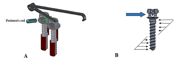
Fig. 3. A) Periotest Evaluation on STS. B) Force distribution by applying periotest's rod on a single miniscrew.

Based on results regarding increased stability in STS. A force distribution can be analyzed and compared between single screw system and STS. As demonstrated in figure 3. In STS, as we applied periotest's rod perpendicular to the long axis of miniscrew; the horizontal retentive arm between screws transfers the force to the other miniscrew and it resists against displacement and carries out a part of the force. The maximum tension probably is decreased and increased stability results reduced micro movements of miniscrews due to periotest evaluation. In the other hand, when we applied force to the single miniscrew system, statically, the force is resisted by a triangular distribution around the center of rotation. In application of single miniscrew, maximized reaction is produced in top and bottom of the miniscrew body, which produces excessive tension to the surrounded bone and reduced stability.