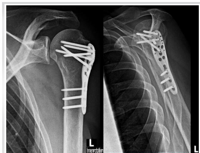
Figure 3: Radiographic examination in a.p. view (a: +internal rotation) and Neer view (b) showing osseous consolidation and anatomical alignment at 12-month follow-up.

SB – as used in this case – is a technical variant of the SutureBridge™ (Arthrex, Naples, Florida, USA) which uses two BioComposite SwiveLock™ anchors (Diameter 4.75 mm,