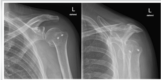
Figure 1: Radiographic examination in a.p. (a) and Neer view (b) showing an anatomical neck fracture of the proximal humerus (AO/OTA 11C1.3, Neer Type II) with a fracture line through the anchor site.