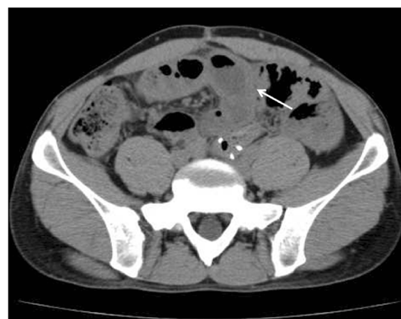
Figure 1 Abdominal computed tomography shows a dilated and filled small intestine enveloped by a thickened membrane (arrow).

Approximately 15 months after surgery, the patient presented to our hospital complaining of nausea, abdominal distention, and abdominal pain. His body weight had decreased from 60 kg at the time of initial surgery to 50 kg. Levels of the tumor markers, carcinoembryonic antigen and carbohydrate antigen 19–9, were within normal range. Abdominal x-ray showed increased intestinal gas and gas-fluid levels. He was admitted to the hospital with a diagnosis of adhesive intestinal obstruction. Abdominal computed tomography (CT) scan showed a dilated small intestine enveloped by a thickened membrane (Figure 1). After admission, we diagnosed as EPS based on these data. He was treated with decompression via long intestinal tube and with intravenous betamethasone administration. After 3 days, intestinal obstruction