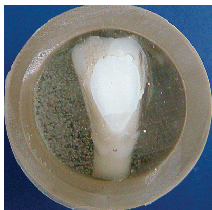
Figure 1 - Aspect of the enamel after cariogenic challenge. Compare white spot lesion with healthy enamel (lower portion) previously protected with nail polish.