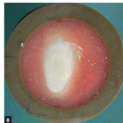
Figure 2 - Enamel treated with Icon infiltration treatment (A) and ClinproXT Varnish (B).