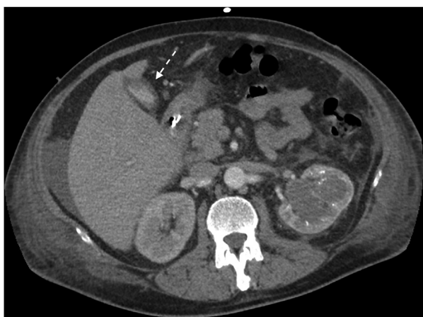
Fig. 1. Pre-operative TC that highlight the presence of a thickened wall of the gallbladder.

The result of histological exams confirmed multiple spots of high-grade carcinoma in hepatic tissue with an immunophenotype compatible with urothelial carcinoma (CK 5/6-; CK20 +; CDX2-; PAX8-; TTF1-). A high-grade urothelial carcinoma (pT3) was detected in the left