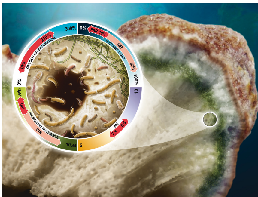
Fig. 1 Spatial structure and physicochemical environment experienced by microbes within the coral skeleton. The close-up depicts a typical skeletal pore populated by a range of autotrophic (green) and heterotrophic microbes (other colours). These organisms typically experience daily fluctuations in pH (from 7.5–8.5) [41], oxygen (10–210% air saturation) [15] and light (0–10% of PAR and 0–80% of NIR) [29]. In addition, they are exposed to enriched levels of dissolved inorganic phosphorus (DIP) and to concentrations of dissolved inorganic nitrogen (DIN) 10 times higher than in reef water [31, 40]. Outline of the coral from [54]