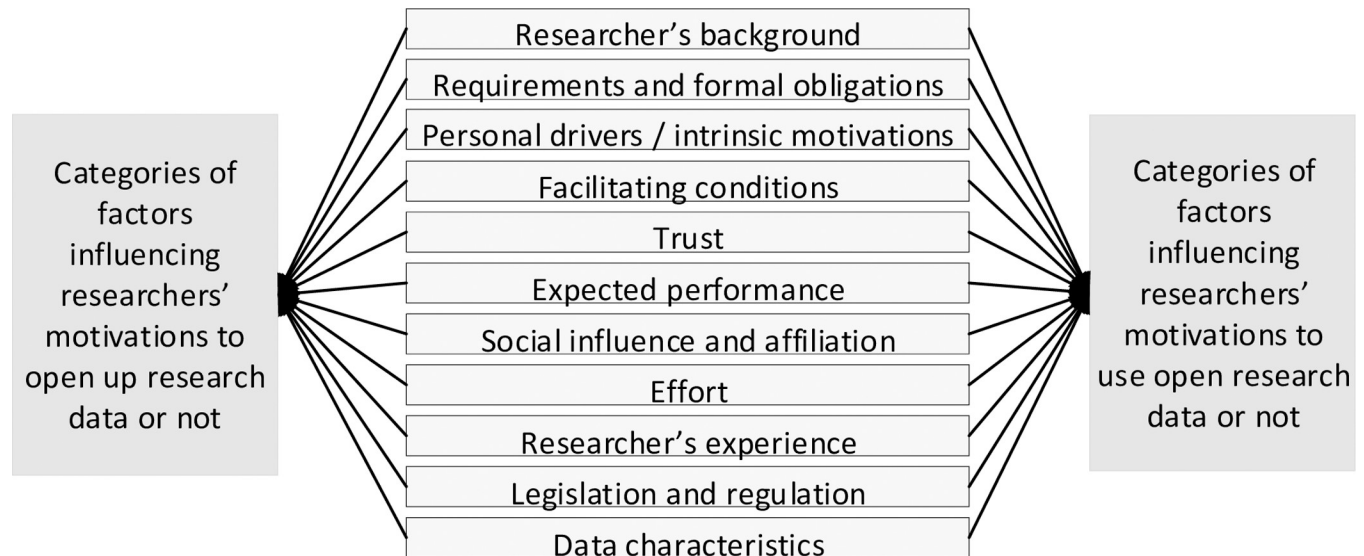
Fig 2. Categories of factors influencing whether researchers are driven or inhibited to share and use open research data.

https://doi.org/10.1371/journal.pone.0239283.g002