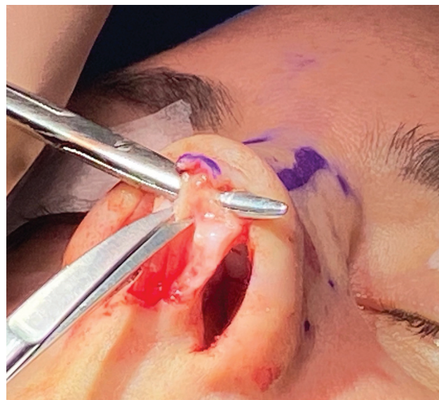
Fig. 1 Meticulous dissection of Pitanguy ligament. Dissection and cutting at the distal part of the Pitanguy ligament in open approach rhinoplasty.

Considering the needs of reduction, the upper lateral cartilages are sectioned in their internal portion and