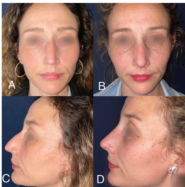
Fig. 7 Patient 2: Before and after rhinoplasty with recycled dorsum preservation. (A) Frontal view before surgery. (B) Frontal view after surgery. (C) Lateral view before surgery. (D) Lateral view after surgery.

The open approach of this modified technique not only allows us to have a wide anatomical exposure, but also gives us the additional advantages like comfort in handling of nasal tip, reducing skin when is necessary, and to avoid any respiratory complications.