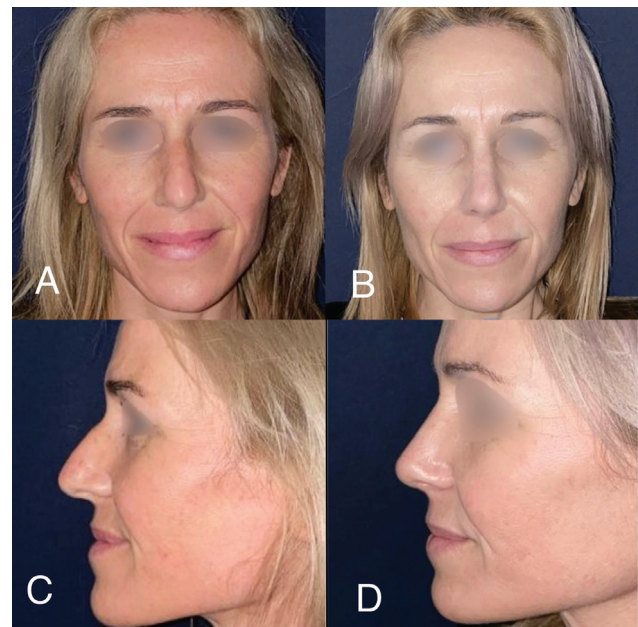
Fig. 6 Patient 1: Before and after rhinoplasty with recycled dorsum preservation. (A) Frontal view before surgery. (B) Frontal view after surgery. (C) Lateral view before surgery. (D) Lateral view after surgery.