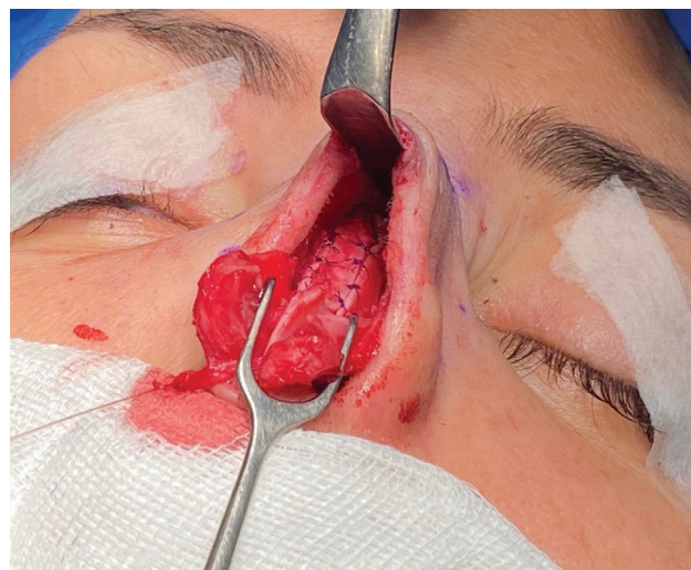
Fig. 3 Final osteocartilaginous dorsum insertion and fixation. Fixation of the reshaped dorsum with polydioxanone (PDS) suture in rhinoplasty.

The procedure ends with nasal tip treatment and subsequent closure of the skin. We clarify that it is not the purpose of this article to describe this part of the surgery (the nasal tip), although we consider it as an integrative part of any rhinoplasty, because it needs a meticulous description and exceeds the objective of this work (Supplementary Material ► Video 1 , available online only).