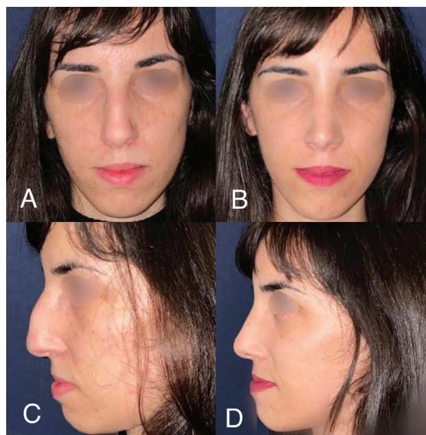
Fig. 8 Patient 3: Before and after rhinoplasty with recycled dorsum preservation. (A) Frontal view before surgery. (B) Frontal view after surgery. (C) Lateral view before surgery. (D) Lateral view after surgery.

Dorsal preservation surgery continues to be a reliable procedure, especially with the addition of a recycled hump.