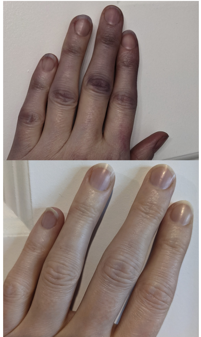
Figure 5. Patient 2—Bilateral acrocyanosis of the hands, from the proximal interphalangeal joint extending to the fingertips, of 9 months (top) after onset of symptoms and after resolution (bottom).