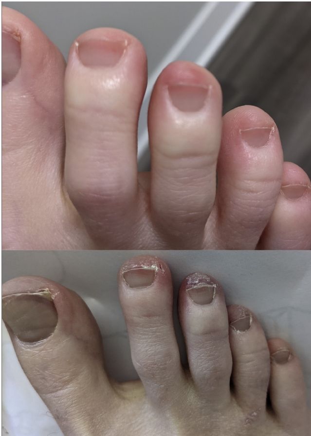
Figure 4. Patient 2—COVID toes at 9 months (top) and 11 months (bottom) after symptom onset.

Thirteen months after the onset of acute COVID-19 infection, the patient substituted 25 mg diphenhydramine HCl for the fexofenadine as she had run out of the latter. She did not seek guidance for this medication change using an online source. The following morning, she noted resolution of brain fog and fatigue. She therefore continued the diphenhydramine daily, whereupon she noted marked improvement in brain fog, fatigue, and abdominal pain, and