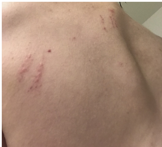
Figure 2. Patient 1—Rash on left upper back and 3 linear rashes on upper back on the spine.

Six months after the initial infection (June 2020), the patient ate cheese, to which she has a known allergy. She therefore self-administered an over-the-counter oral histamine antagonist, diphenhydramine HCl 50 mg. The following morning, she noted considerable relief of fatigue and improved ability to concentrate.