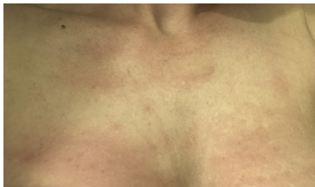
Figure 1. Patient 1—Patient with COVID-19 presented with rash on her chest.

symptoms. To date, however, she experiences persistent rashes in multiple locations as well as flank pain, bilateral chest pain, and right-sided headache.