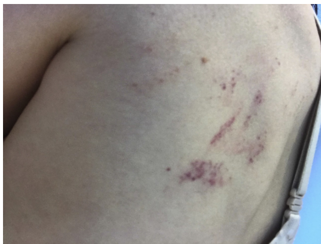
Figure 3. Patient 1—Rash on left scapula.

She did not take additional histamine antagonists for the next 72 hours, during which time she experienced a recurrence of the fatigue and cognitive symptoms. The patient again self-administered diphenhydramine, and observed an improvement in symptoms. After 6 months of daily self-administration of diphenhydramine HCl 50 mg, the patient was prescribed hydroxyzine pamoate 25 mg and instructed to titrate the dose not to exceed 150 mg/d, until relief of symptoms occurred. At 25 mg daily, she experienced partial symptom resolution with decreased rashes and bruising, improved cognition, and reduced fatigue. On follow-up, the pulmonologist also noted these effects.