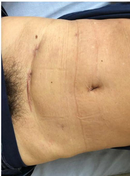
Figure 2 Pfannenstiel incision made 2–3 cm above the symphysis pubis at the border of the pubic hair.