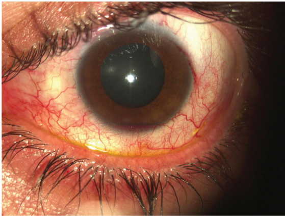
Figure 2 Patient with a small hyphema.