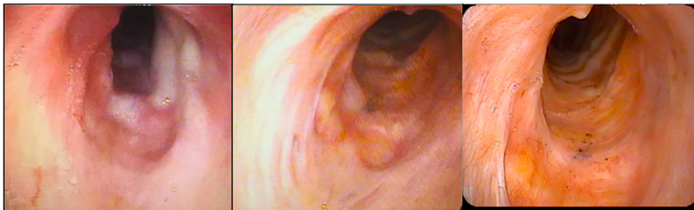
Fig. 2. Pre/post-office subglottic corticosteroid injection laryngoscopy images. This sequence demonstrates initial stenosis 4 weeks after surgery at the time of initial injection (left), the change after two serial injections spaced approximately 1 month apart (center), and the appearance 6 months after third and final injection (right).