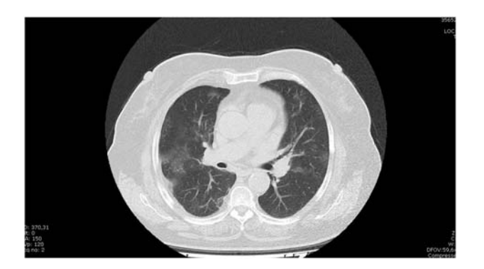
Fig. 3. Bilateral, multilobular ground-glass opacities.

In conclusion, the patient with Melkersson–Rosenthal syndrome presented to our emergency department with rare clinical findings of the classic triad. The patient was diagnosed with COVID-19 pneumonia after a series of procedures carried out based on the recent-onset malaise in her history. COVID-19 infection, which was not previously included in the etiology of the disease, can now be considered among the causes of recurrence of the syndrome. Moreover, further research on mast cells will positively contribute to the treatments of both diseases.