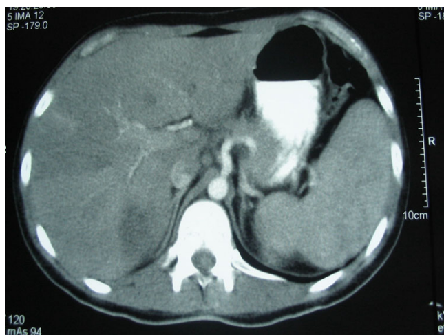
Figure 1 Abdominopelvic contrast-enhanced computed tomography. Multiple liver abscesses and mesenteric partial thrombosis.

sound with colour Doppler is crucial in establishing the diagnosis of this condition. However, CT scan is more sensitive than ultrasound for detecting a thrombus within the splenic and mesenteric veins, and therefore should be the preferred imaging technique for detecting both thrombi and pericolic abscesses [10]. It should be pointed out that the detection of thrombus in the portal vein or one of its tributaries does not necessarily indicate septic thrombophlebitis. Treatment in these circumstances is based on a strategy of antibiotics and eradication of the septic focus. A broad spectrum antibiotic coverage is crucial, but the appropriate timing of their administration is less clear. Given the frequency of hepatic abscesses as a complication of pylephlebitis, and since they may not be visualized in a CT scan (with or without drainage), a minimum of 6 weeks antibiotic therapy seems prudent [13,14]. The role of anticoagulation or thrombolytic ther-