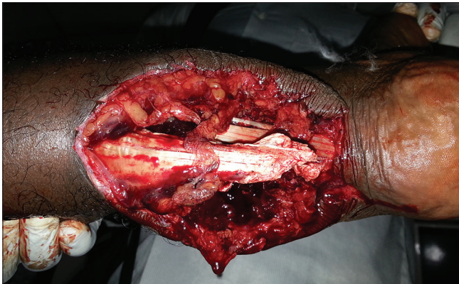
Figure 4: Preoperative picture showing exposed Achilles tendon. The cavitation effect of the gunshot damaged the sural artery

Perforators in the proposed donor tissue close to the defect were located preoperatively using handheld Doppler (probe) and marked on the skin using methylene blue [Figure 7]. The flaps were then designed like blades of a propeller adjacent to the defects. The proximal end of the flap to the targeted perforator is made equidistant from the distal end of the defect to the perforator.