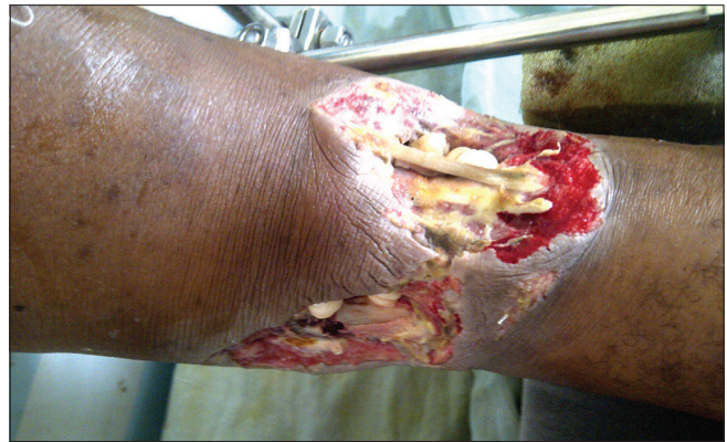
Figure 1: Preoperative picture before debridement

The second patient was shot during an argument; he sustained Gustilo 3B open fractures. The entry wound was quite small, but the exit wound located posteriorly measured 14 cm × 11 cm and a large portion of the Achilles tendon was exposed. The sural artery was found severed in the wound