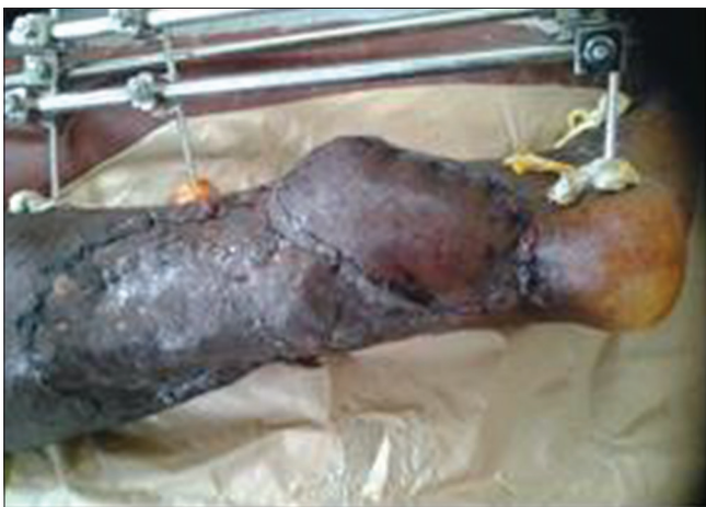
Figure 6: Fifth postoperative day

The flap sizes were made to be 0.5 cm more than the size of the defect to be covered to aid closure without tension.