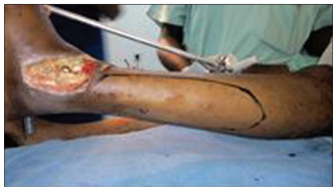
Figure 7: Preoperative planning showing the flap outline. Identified perforators were marked as x on the outline