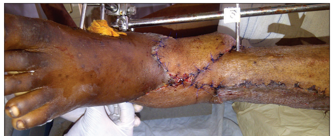
Figure 2: Immediate postoperative picture