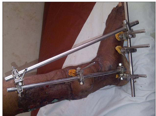
Figure 3: Follow-up picture 6 weeks postoperatively