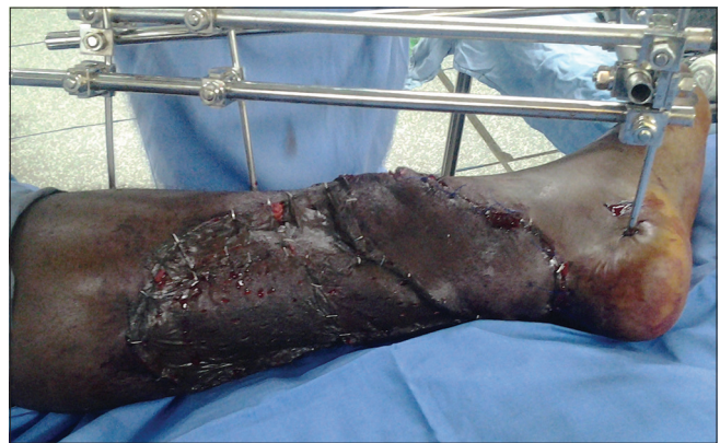
Figure 5: Immediate postoperative picture

The sizes of the secondary defects were reduced by suturing and the remaining defect skin grafted. Primary closure was not possible in all the donor sites due to the size of flaps harvested. Bedside, flap monitoring was achieved via a window created within the dressing to examine the flaps.