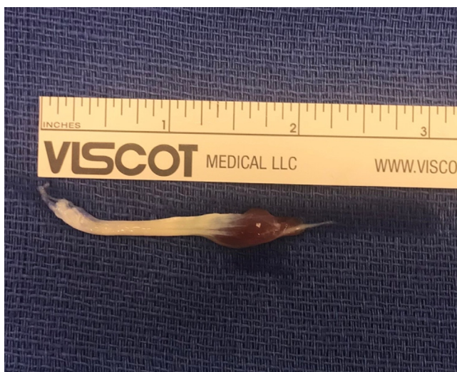
Figure 1. The extensor digitorum brevis manus excised with the short muscle belly and the tendon.

compartment was identified, and the retinaculum was partially incised with a pair of tenotomy scissors. No effect on the tendons within the fourth compartment was identified when tension was applied to the cut end of the EIP distally. The incision was extended distally to explore the EIP tendon. The tendon was truncated with a distal muscle belly underlying the fourth compartment tendons (Fig. 1). The length and position were inadequate to transfer to the EPL (Fig. 2), and the decision was made to harvest half of the second EDC back to the level of the wrist crease for transfer. A third incision was made dorsal to the ulnar insertion over the thumb at the distal end of the ruptured EPL tendon. The EDC split graft was tunneled from the wrist crease to the third incision. A Pulvertaft weave was performed and secured with 4-0 Fiberwire (Arthrex). The tenodesis effect was checked thereafter to confirm the adequate tension of the repair (Fig. 3).