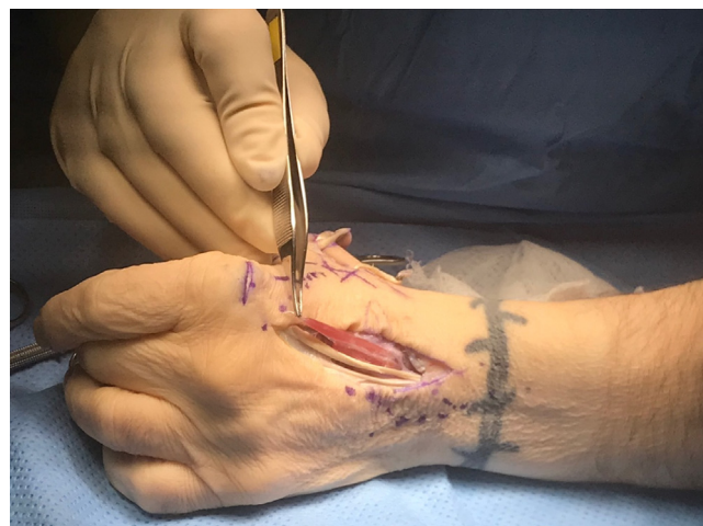
Figure 2. The appearance of the extensor digitorum brevis manus encountered intraoperatively.

The mechanical irritation theory follows the logic that bony irritation causes tearing of the tendon as it slides across any sharp cortical step-off formed during fracture healing. 4 In addition, as the tendon traverses toward its attachment at the dorsal base of the