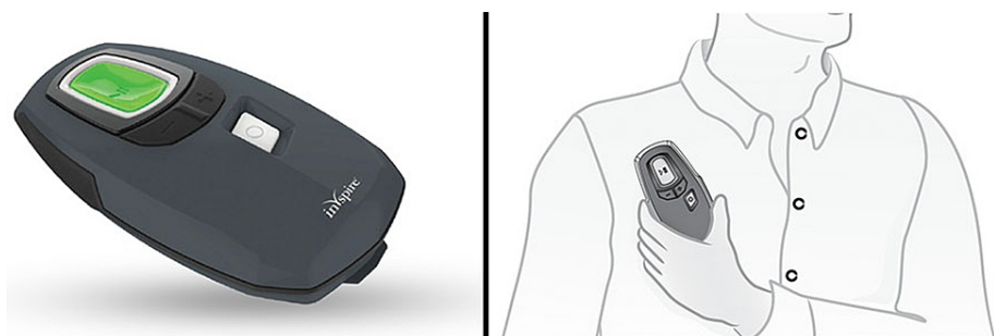
FIGURE 2: Sleep remote for the HGNS system.

The system consists of a stimulating electrode, pressure-sensing lead, and a pulse generator. HGNS: hypoglossal nerve stimulation.