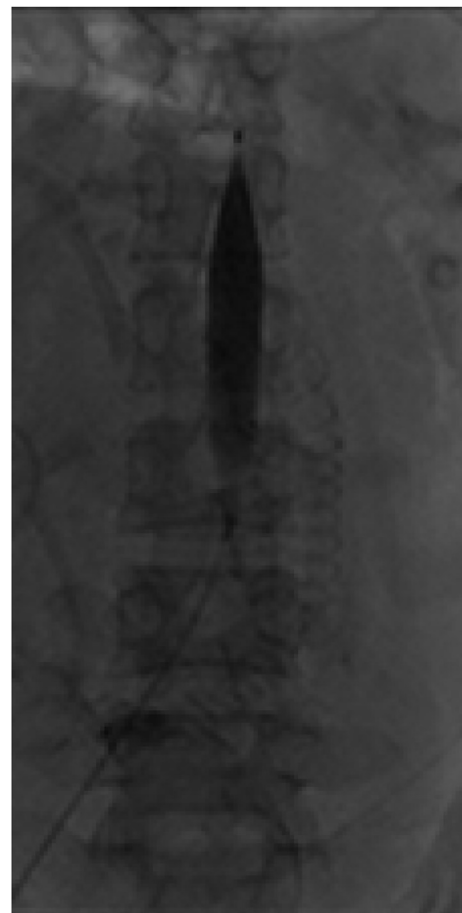
Fig. 2. The balloon was inflated to occlude the abdominal aorta.