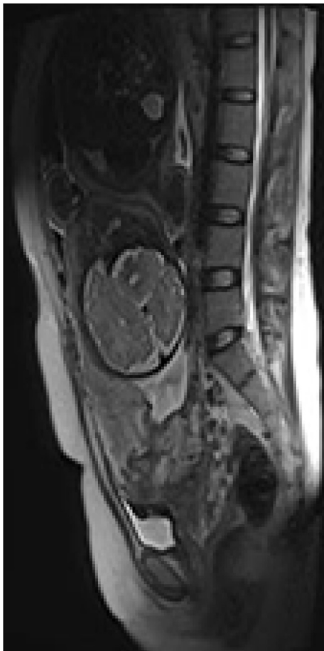
Fig. 1. In placenta previa complicated with placenta accreta, the boundary between the placenta and the myometrium is unclear.

After the obstetrician cut the umbilical cord of the fetus, the interventional doctor immediately filled the balloon with saline to block the abdominal aortic artery, and monitored the balloon occlusion index to ensure that the blood oxygen of both toes decreased slowly to 0, blood oxygen curve was flat, and the heart rate gradually cannot be monitored. The obstetrician peeled the placenta at the same time, and balloon inflation time was selected according to the intraoperative placental detachment. Each inflation time did not exceed 15 min. If necessary, the balloon was completely released for 1 min. The balloon was re-inflated, and the total inflation time did not exceed 45 min. If a placental accretion of the cervix was found during the surgery, gauze pads were utilized to temporarily compress and stop the bleeding, and an emergency sequential uterine artery embolism was performed after suturing the uterus. At the end of the placental peeling, the placenta and myometrium were sutured. If after the suturing the uterine incision, active bleeding was still observed on pressing the floor of uterus, then the balloon was