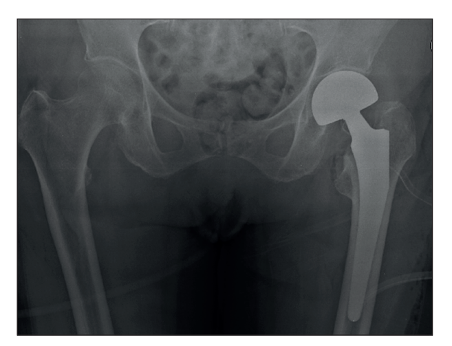
Figure 3. Subcapital Fracture Trated With Hemiarthroplasty

As for Parma, the 2019 cohort includes 79 patients with proximal femoral fractures: 29 males (36.1%) and