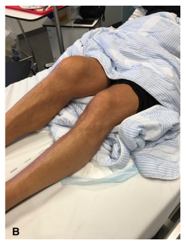
Figure 1 (A,B) The right knee was markedly swollen.