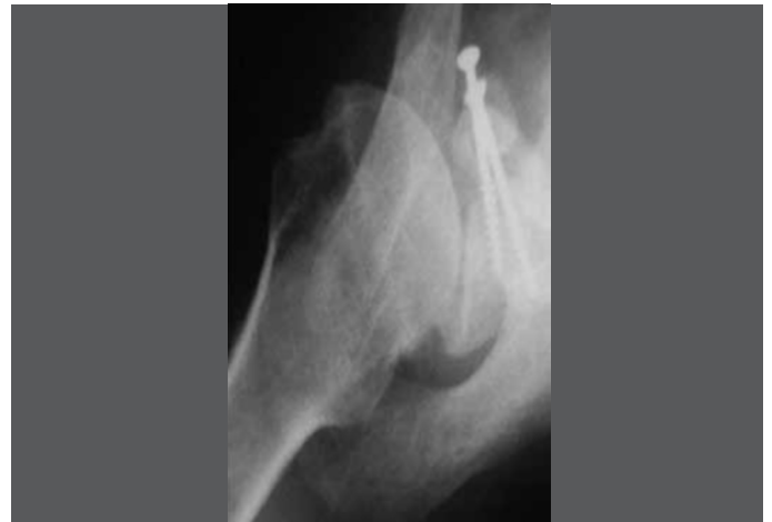
Figure 3 – Simple radiograph in Bernageau view showing non-consolidation of bone graft.

Regarding postoperative complications, four patients presented signs of osteolysis on the screws, and two of these patients also had signs of pseudarthrosis in the graft (Figure 3). In two patients, fixation of the graft could not be achieved with two screws: one, because the graft broke during the operation; and the other, because of the short osteotomy of the coracoid (Figure 4). In four patients, it was observed that the screws were incorrectly positioned (Figure 5). In these cases, the attitude of the screws was not perpendicular to the glenoid because the graft was in a lower position.