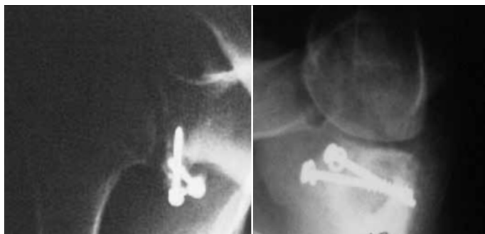
Figure 5 – Simple radiograph in corrected AP and Bernageau views showing incorrect positioning of the screws due to incorrect positioning of the graft (more inferiorly than it should have been).

of any degree (mild, moderate or severe) than among those without arthrosis ( p = 0.008 ). There was no difference in the degree of arthrosis in relation to the number of previous dislocations ( p = 0.069 ). There was also no relationship between development of arthrosis and limitation on lateral rotation along the side of the body ( p = 0.079 ) or with abduction of 90^\circ ( p = 0.078 ).