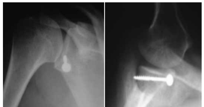
Figure 4 – Simple radiographs in corrected AP and Bernageau views showing short graft fixed with only one screw.

Eleven patients (42%) did not present any radiographic evidence of arthrosis, while 15 did show evidence. Of the latter, 11 were classified as grade I (42%), three as grade II (12%) and one as grade III (4%). We found that the episodes of dislocation were greater among the patients who presented arthrosis