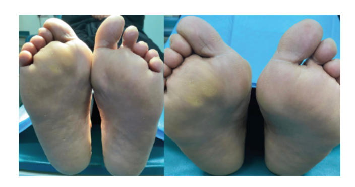
Figure 3. Complete resolution of skin lesions few days after surgical excision of tumor

mucinous cystic neoplasm was kept. The patient was then referred to general surgery under the hepatobiliary division and underwent an urgent distal pancreatectomy and splenectomy a week after. The mass was excised and was sent to pathology for histologic assessment, the diagnosis of mixed serous cystadenoma and neuroendocrine neoplasm (mixed serous neuroendocrine tumor) of the pancreas was confirmed. Days after undergoing surgery, the skin showed resolution of the palmoplantar keratoderma (Figure 3). Nearly two years after cancer excision, follow-up cutaneous