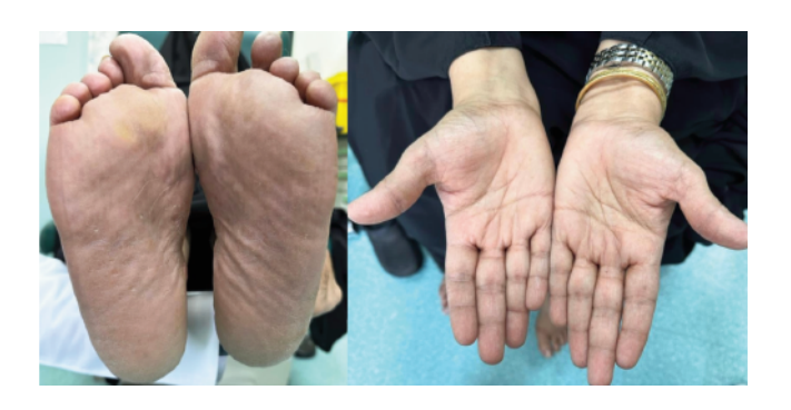
Figure 4. Follow-up two years after cancer excision showing complete clinical remission of palmoplantar lesions.

examination of the palms and soles showed signs of complete clinical remission (Figure 4). MRI of the abdomen was done, the remaining pancreas revealed normal signal intensity and homogenous enhancement with no suspicious focal lesions and no evidence of any local recurrence (Figure 5).