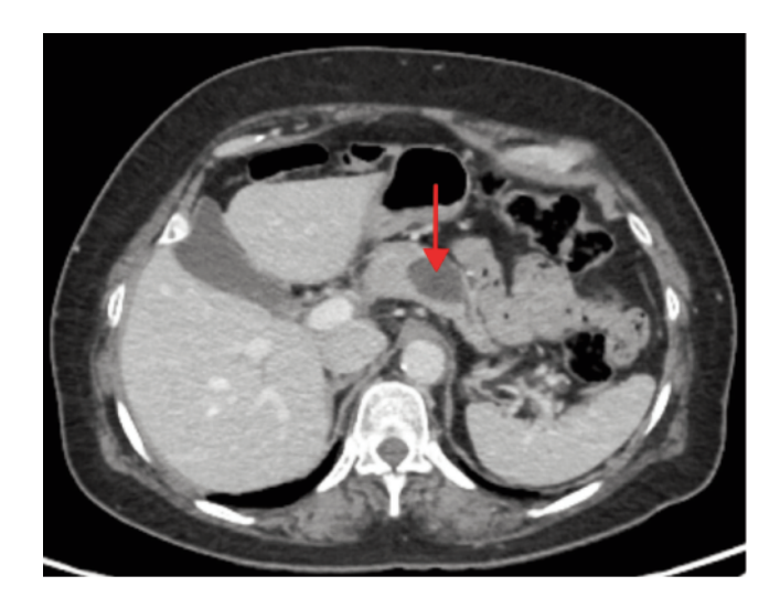
Figure 2. CT scan of abdomen transverse section (red arrow): a cystic pancreatic body mass.

respectively. The cystic lesion demonstrated multiple mildly thickened septations in its superior aspect, with no obvious solid nodules. The mass appeared to be communicating with the main pancreatic duct, with mildly dilated pancreatic duct distal to the lesion. No abdominopelvic metastasis was noted. The differential of side branch intraductal papillary mucinous neoplasm and