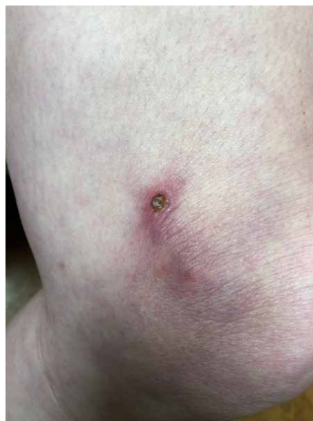
FIGURE 2: The right lateral thigh was found to have a purpuric patch with central ulceration and necrosis.

on her right thigh and right forearm. On examination, the right dorsal forearm was now found to have two firm, tender erythematous papulonodules, one with central ulceration (Figure 1). The right lateral thigh was found to have a single purpuric patch with central ulceration and necrosis (Figure 2). The bilateral forearms additionally had a few scattered linear superficial abrasions consistent with animal scratches. No other new lesions were found on examination. She perceived these lesions as dissimilar from her typical LV, but at this time mycophenolate mofetil 500 mg twice daily was added for her ongoing LV flares. A 4 mm punch biopsy of a