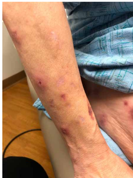
FIGURE 1: The right dorsal forearm was found to have two firm, tender erythematous papulonodules, one with central ulceration.

In the fall of 2018, she presented to dermatology during an acute LV pain flare and was coincidentally found to have an erythematous papule at the right dorsal forearm, which she attributed to a possible insect bite or a scratch from her dog. Three weeks later, she reported worsening of this right forearm lesion as well as new onset of two painful, ulcerative lesions