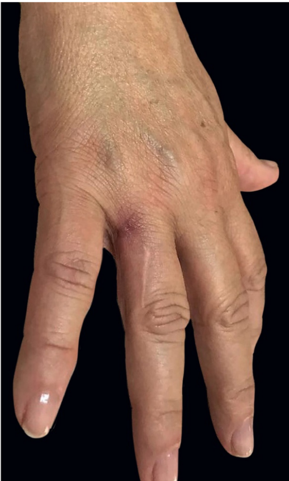
Figure 3 Regression of inflammation after antibiotic treatment.