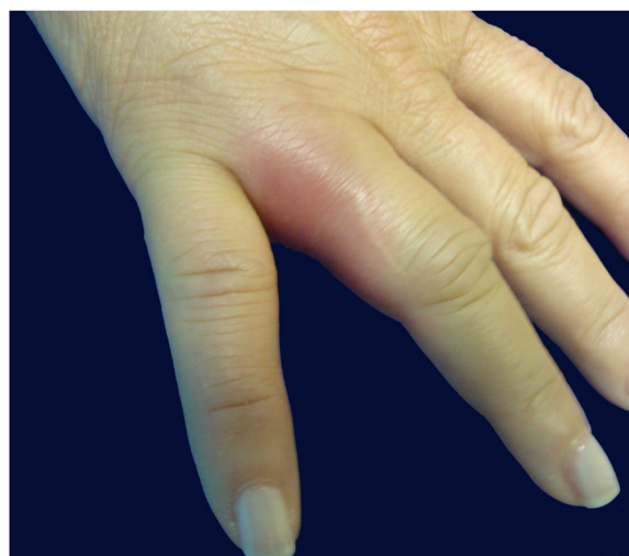
Figure 1 Right hand: edema and erythema on the fourth finger.

species are: M. fortuitum , M. chelonae , and M. abscessus . M. fortuitum is related with hospital infections in immunocompromised patients, leading to pulmonary, soft tissue and bone infections. Cutaneous involvement is more related to postoperative situations and invasive cosmetic procedures. 2 The present case corresponds to cutaneous infection by M. fortuitum in an immunocompetent patient, acquired at home, probably by a trauma in an humid area. Differential diagnosis is made with swimming-pool granuloma, caused by M. marinum , due to the circumstances in which the infection was acquired, but culture allowed to the definitive etiology. The diagnosis of atypical mycobacterioses is made through the isolation of the agent in culture, since radiological, histopathological and clinical examinations are often inconclusive. The history of long-standing infection, without improvement after different treatments, can lead to clinical suspicion. The follow-up includes long-term broad-spectrum antibiotic treatment. The macrolide group in combination with quinolones is one of the most recommended regimens, sometimes requiring surgical intervention. 3,4 The present report reinforces the importance in considering atypical mycobacterioses among the differential diagnoses of traumatic cutaneous lesions, especially when they tend to chronicity.