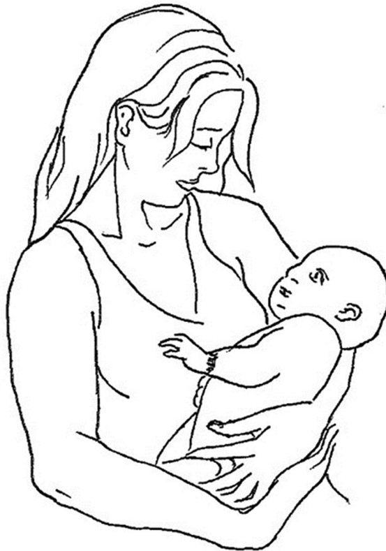
Figure 1. Graphic representation of left-cradling behaviour (courtesy of Rocco Cannarsa).

information through their right hemispheres 22–25 . Therefore, left cradling might be included in a repertoire of lateralised behaviours capable of improving individual biological fitness. The exact evolutionary pressures which shaped these behavioural asymmetries are still unclear, but animal studies seem to suggest a common pattern of lateralisation in vertebrates according to which the left hemisphere would be specialised for processing approach and manipulation responses, whereas the right hemisphere would be better specialised for avoidance responses, for detecting and reacting to threatening stimuli (such as predators), and for monitoring conspecifics (including infants; see Vallortigara & Rogers 26 for a review).