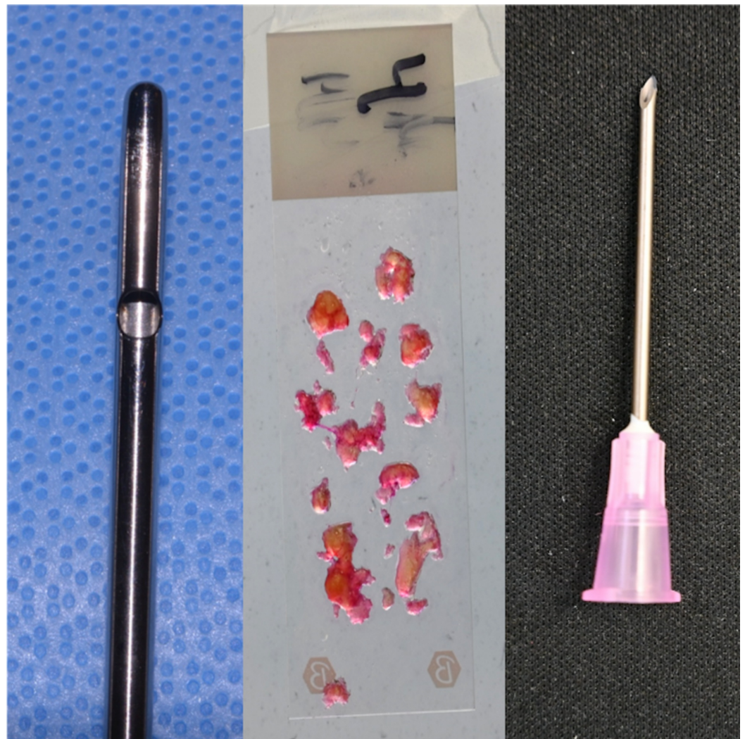
FIGURE 2: Fat harvested with a 4-mm cannula produced particles up to 4 mm in size, which were successfully injected without obstruction through a 16-gauge needle with a nominal internal diameter of 1.19 mm.