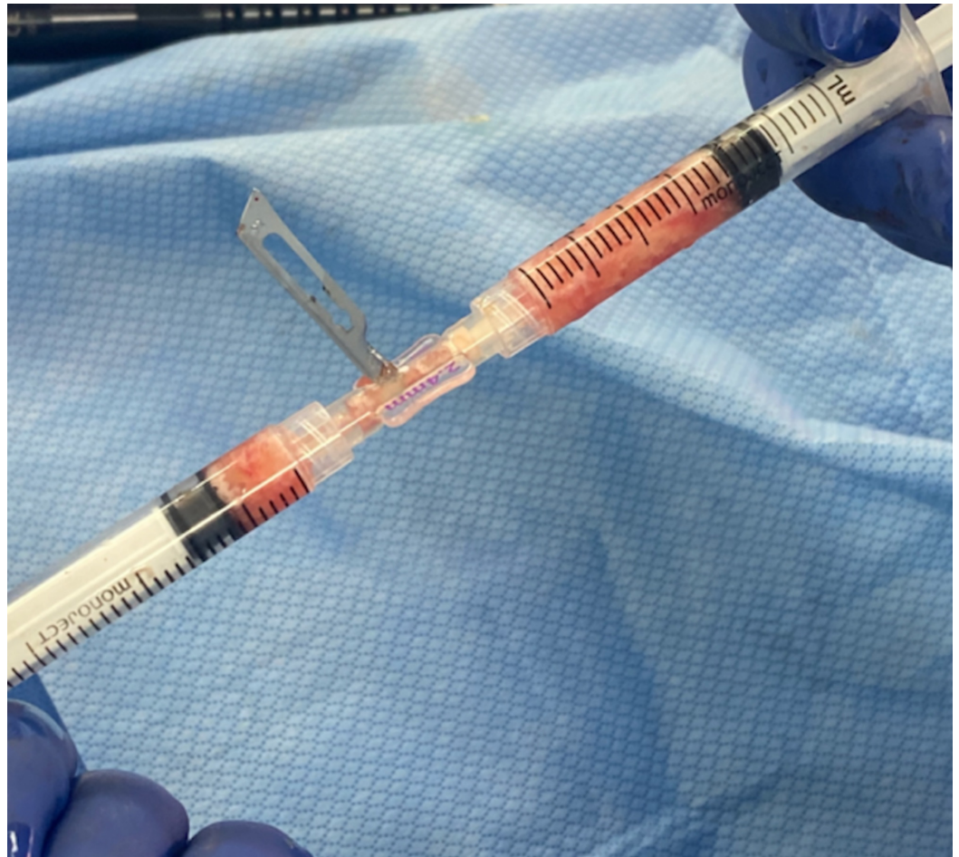
FIGURE 6: Blade in a Luer-to-Luer connector.