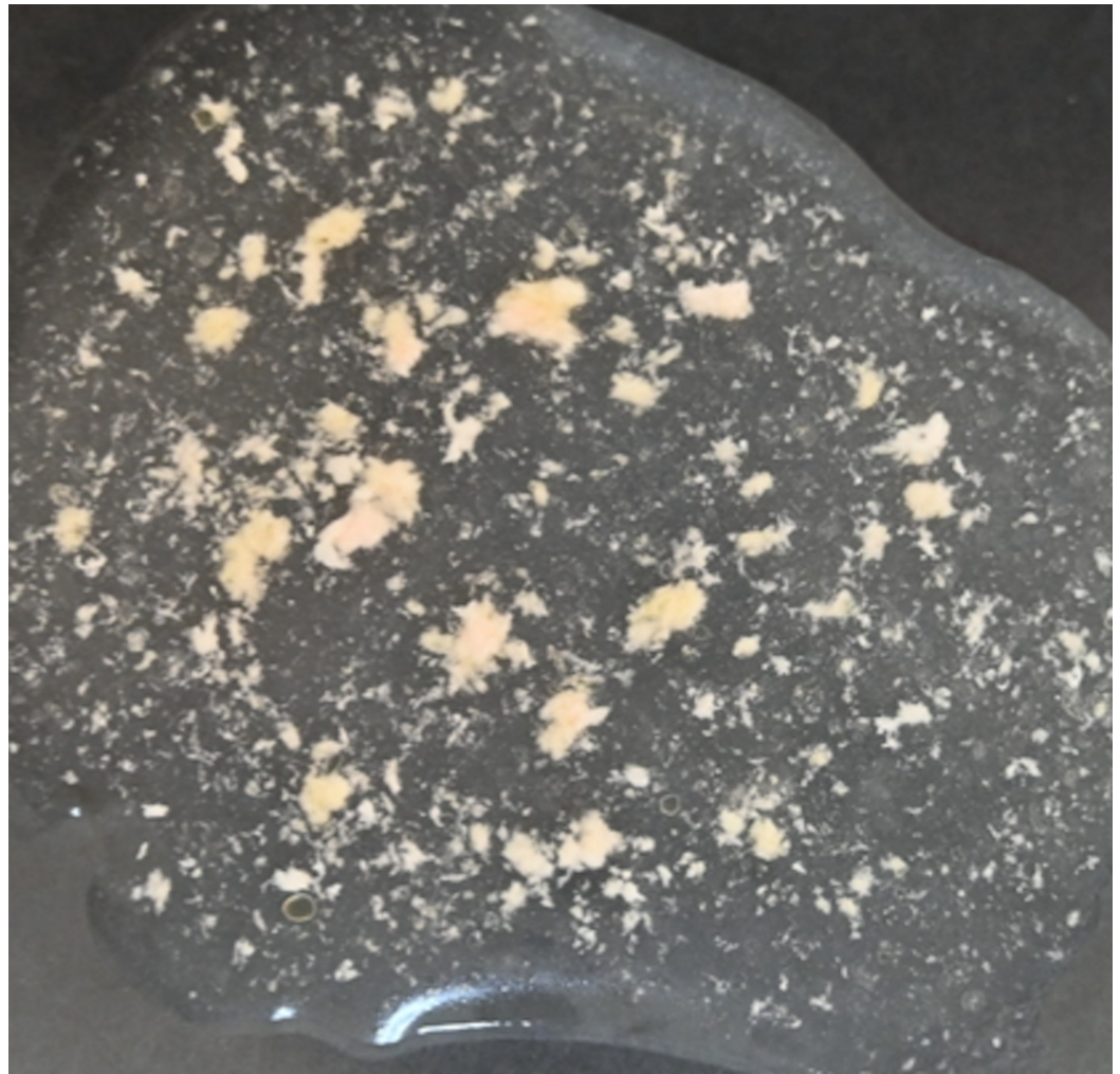
FIGURE 1: Fat harvested with a 4-mm cannula produced a variety of particle sizes.