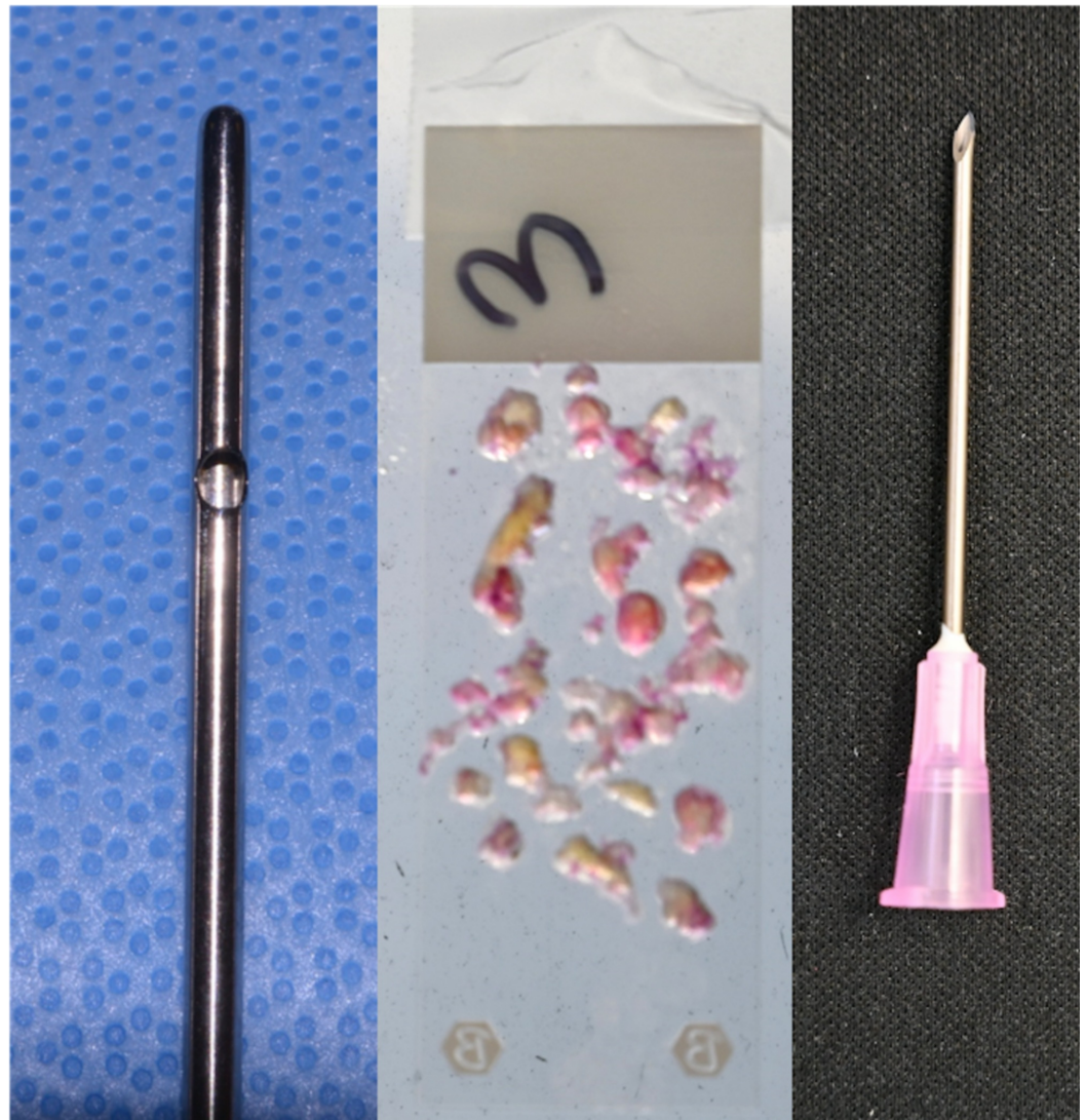
FIGURE 3: Fat harvested with a 3-mm cannula produced particles up to 3 mm in size, which were successfully injected without obstruction through a 16-gauge needle with a nominal internal diameter of 1.19 mm.