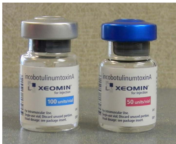
Figure 1 Recently US FDA approved botulinum toxin type A, Xeomin ® (incobotulinumtoxinA).

In all naturally occurring serotypes of botulinum toxin (types A–G), the active neurotoxin (150 kDa; 100 kDa of a heavy chain and 50 kDa of a light chain) is noncovalently associated with a set of nontoxic and inactive complexing proteins (hemagglutinins [HA] and non-hemagglutinins [NHA]) and thus forms high molecular toxin complexes. 6,16–18 The molecular weight of the toxin complex ranges between 230 and 900 kDa, depending on the serotype. 1 All previous BoNT drugs, including Botox ® and Dysport ® , contain these nontoxic and inactive complexing proteins in addition to the neurotoxin (Figure 2). 6 This new preparation, Xeomin ® , is derived from a wild-type strain of C. botulinum type A