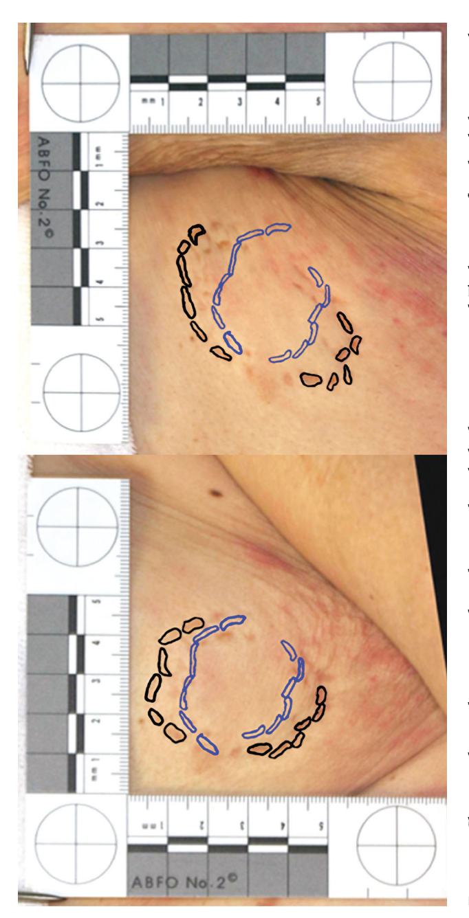
Figure 4. Changes in bitemark appearance depending upon how the body part is positioned. The bite was inflicted with the arm straight at the side (left). The bitemark is outlined in black for ease of viewing; biter's overlay is in blue. Notice the alteration to the bite pattern when the arm is positioned over the head (right). [Reprinted with permission of creator, Peter Bush.]