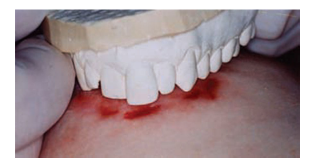
Bitemark evidence from trial of Arizona v Krone. [In public domain.]

expectations, and bitemark experts do not generally employ procedures for preventing such errors: