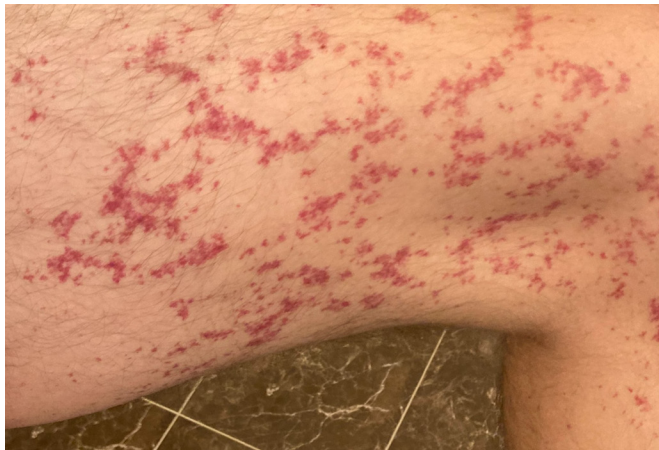
Figure 1 Petechial rash on the lateral aspect of the right lower limb.

such as skin biopsy of the rash and renal biopsy were not carried out.