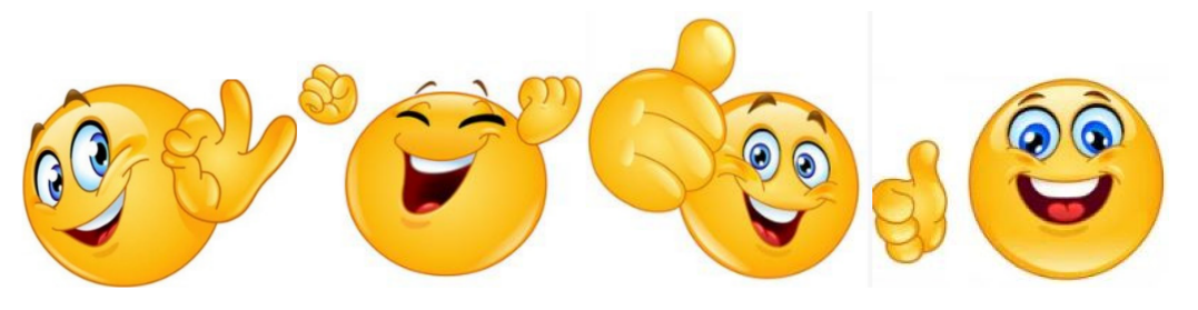
Figure 1. Four positive emojis used in the study.