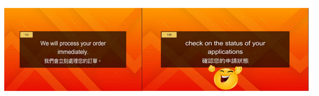
Figure 2. Learning materials with and without positive feedback provided through emojis. Note: The Chinese language is the translation of English above.