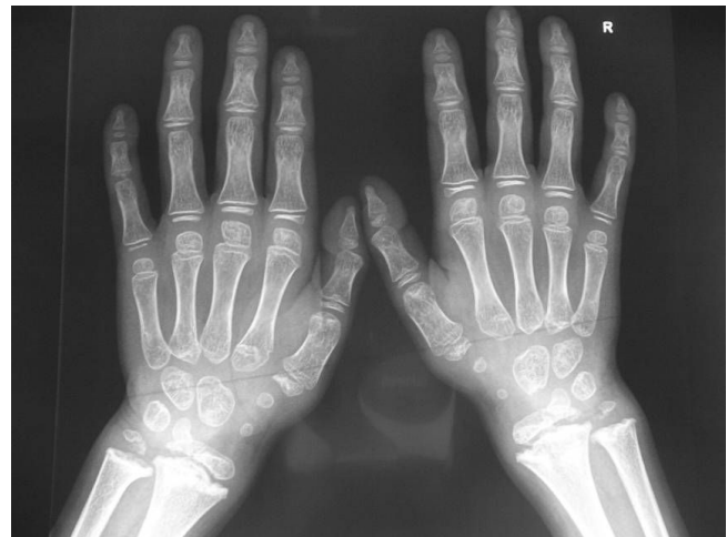
Figure 1 Anteroposterior hand radiograph showed, short-stubby hand with large carpal bones associated with pseudoepiphyses of the second proximal metacarpophalangeal joint.

Approximately half of all individuals with Robin sequence have an underlying syndrome, of which Stickler syndrome is the most common. In one study, 34 of 100 individuals with Robin sequence had Stickler syndrome [9]. Van den Elzen et al., [10] found that 15% of a series