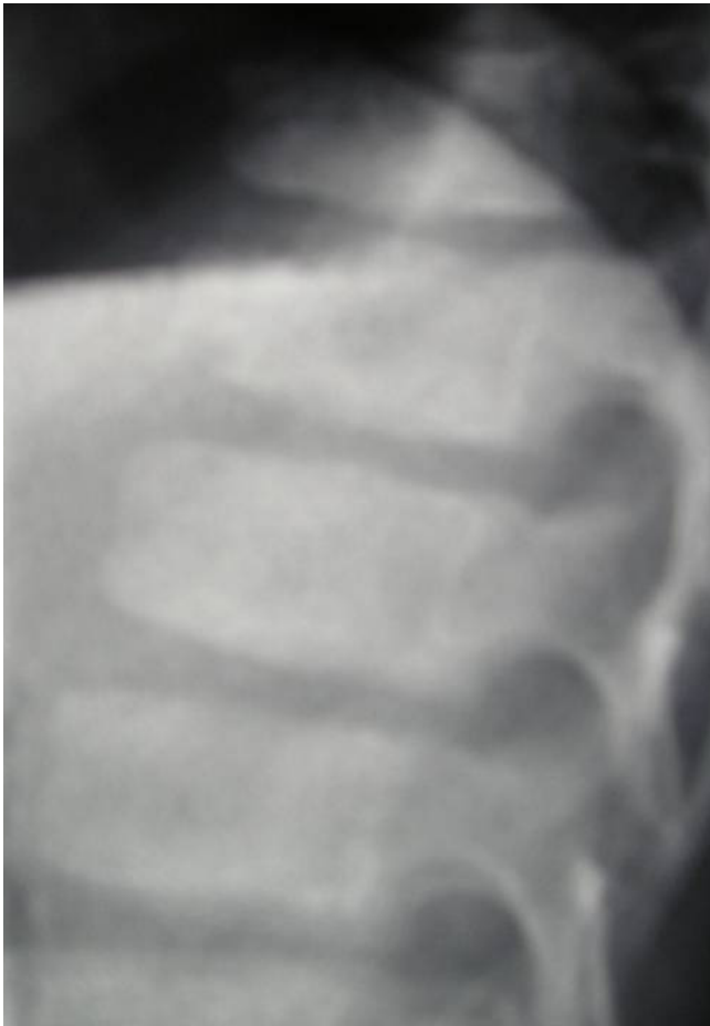
Figure 2 Lateral spine radiograph showed platyspondyly associated with anterior clefting of the vertebrae.

of children with Pierre Robin association had Stickler syndrome. Holder-Espinasse et al., [11] also found that about 15% of cases presenting at birth with Pierre-Robin syndrome had Stickler syndrome. Radiological examination at this time may reveal coronal clefts of the vertebrae, mild platyspondyly and flaring of the metaphyses of the long bones (features of the Weissenbacher-Zweymuller syndrome). As the child grows older these features become normal, although a mild epiphyseal dysplasia may develop. Weissenbacher-Zweymuller syndrome has been described as "neonatal Stickler syndrome," but is actually a distinct entity [12]. It is characterized by midface hypoplasia with a flat nasal bridge, small upturned nasal tip, micrognathia, sensorineural hearing loss, and rhizomelic limb shortening. Radiographic findings include dumb-bell-shaped femora and humeri and vertebral coronal clefts. The skeletal findings become less apparent in later years, and catch-up growth after age two to three years is common [5].