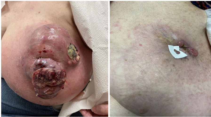
Fig. 1. Breast mass before and after 5 cycles of neoadjuvant chemotherapy.