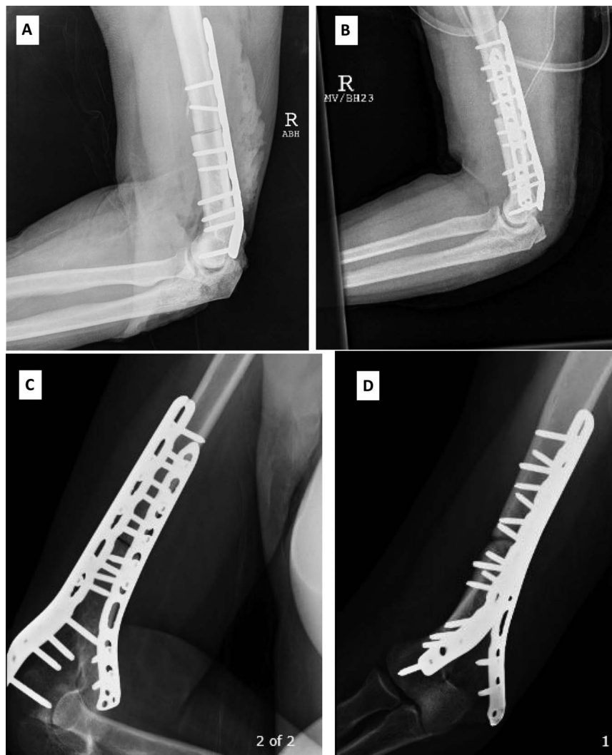
Photographs of the patient who experienced nonunion. A and B , Images during surgery. C and D , Photographs 12 months before revision surgery.

sustained them at 108 and 24 months (9 years and 2 years) after the index distal humerus osteoarticular reconstruction. Both patients with allograft fractures underwent revision surgery with ORIF with iliac crest bone autograft and had no further complications. Both fractures were located near the host bone/allograft junction. No revision, removal, or exchange of the allograft was necessary. The nonunion patient underwent revision of the osteosynthesis 12 months after the index procedure with autologous bone graft and had no further complications (Institutional Case Series Table, Supplemental Digital Content 2, http://links.lww.com/JG9/A111 ).