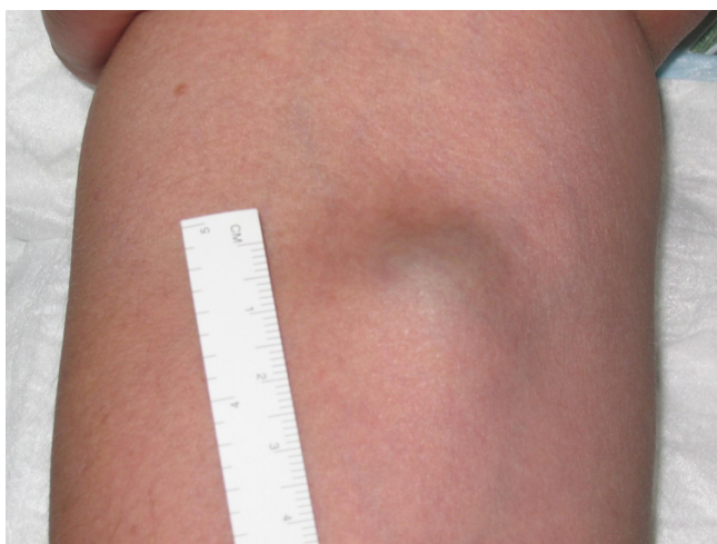
Figure 1 Soft compressible swelling on the right upper arm near antecubital fossa

Histology of the aneurysmal sac showed periphery of the blood vessel with congested lumen and thickened media [Figure 3]. All three layers of the venous wall were preserved in the sac, which was suggestive of a true aneurysm. There was no element of endophleboscrosis or endophlebohypertrophy.