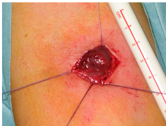
Figure 2 Operative picture of the swelling. Identification and ligation of the feeding vessels prior to excision are key operative steps.